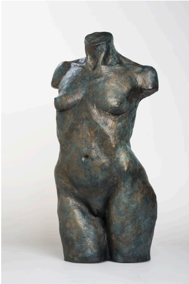
THIRD PLACE Serena Bates I Am Woman Terra Cotta